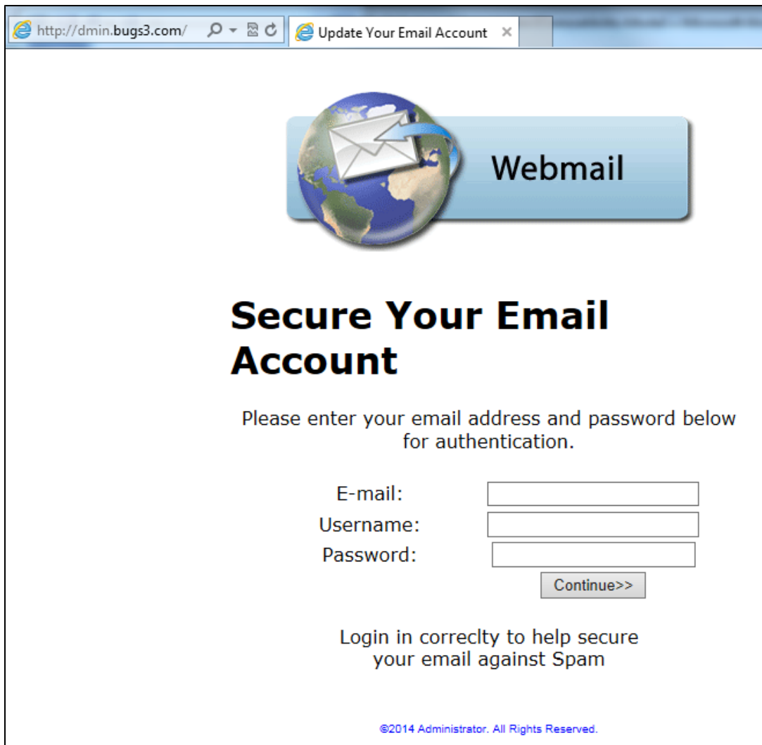
Figure 2: screenshot of the fraudulent webpage the link directs you to