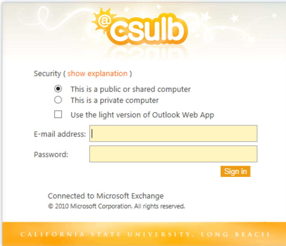
Figure 2: Screenshot of the fraudulent site the link goes to