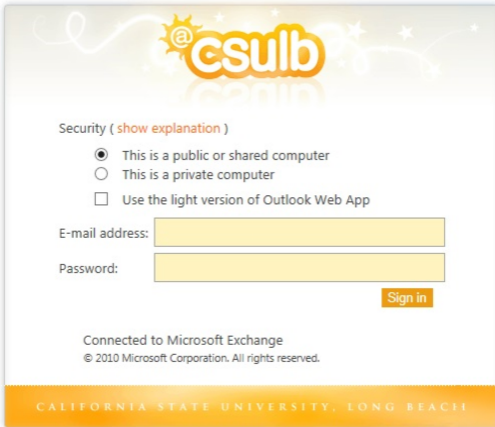
Figure 2: Screenshot of the fake OWA login page