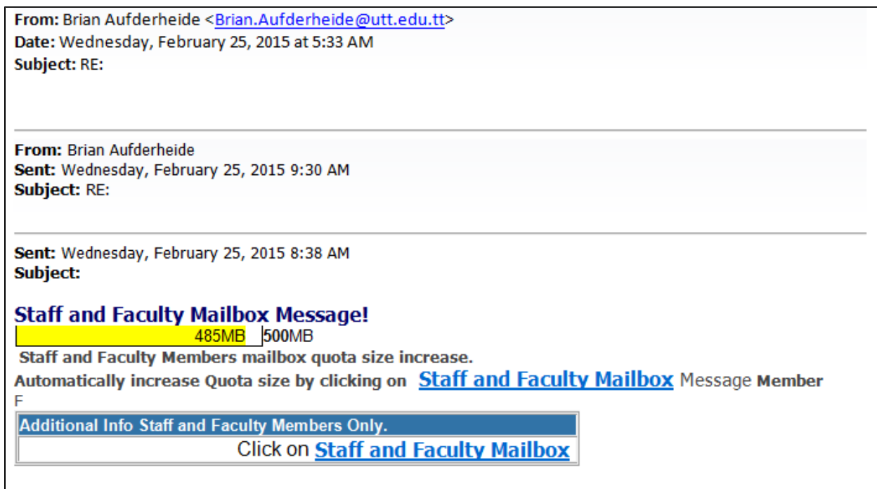
Figure 1: Screenshot of the phishing email